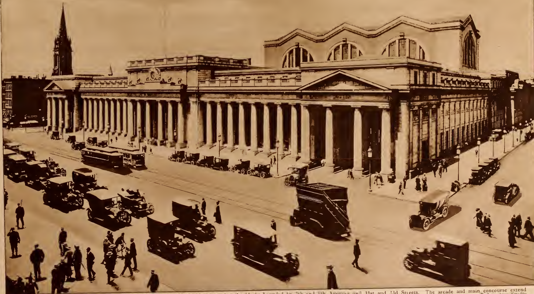
PENNSYLVANIA RAILROAD STATION. Gigantic marble building covering the blocks bounded by 7th and 8th Avenues and 31st and 33d Streets. The arcade and main concourse extend under the street. The Pennsylvania Railroad enters New York through a series of tunnels passing under the Hudson and the East Rivers.